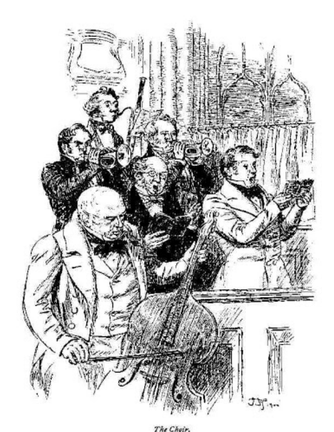
West Gallery Music

In all but the smallest churches the congregation was until recently confined to the