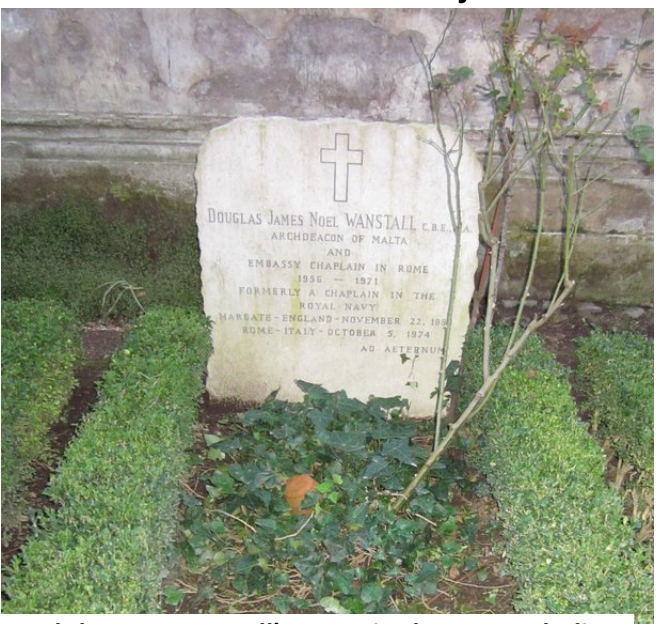
Archdeacon Wanstall's grave in the non-catholic cemetery in Rome

Although competitive sport is not a priority in these difficult times All Saints' has always been happy to welcome sports