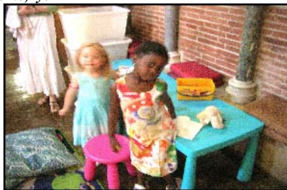
Enjoying the children's corner at All Saints!

We DO wish you both well and trust we WILL see you back with us soon!