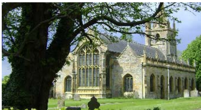
All Saints, Evesham