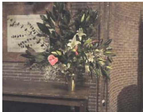
All Saints, Rome