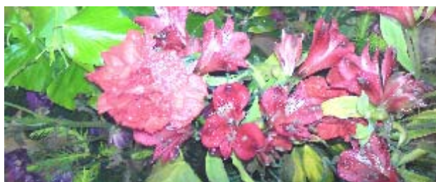
Flowers for Pentecost