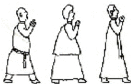
WHY THOSE PEOPLE ARE DRESSED STRANGELY

THINGS YOU WILL NEED TO EXPLAIN IF YOU BRING A FRIEND TO CHURCH