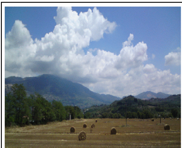
'Bringing in the sheaves' near Fiuggi

Newsletter of All Saints Anglican Church, Via del Babuino 153, Rome, September 2011 Vol 1 No 15