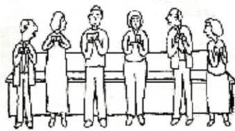
WHY THOSE PEOPLE ARE LOOKING AT US IN A FUNNY WAY