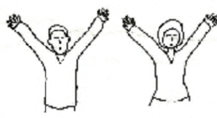
WHY THOSE PEOPLE ARE ACTING ODDBLY