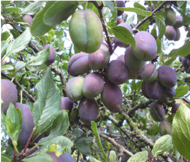
Mellow fruitfulness in a Birmingham (UK) garden

WHEN I SURVEY ... wads of paper and even some pens have again appeared in church, accompanied by impassioned pleas to help All Saints' refresh its church profile, renew its commitment to mission and meet the needs and requirements of members in the 21st century. All Saints' is gathering your views and ideas to help with its ongoing and future planning, to discover the various gifts, experiences, interests and breadth of background of the church community and begin the update the electoral role. PLEASE help by taking ten minutes to fill it this confidential survey ONLINE or on PAPER. It would be much appreciated. Copies in church. THANK YOU!