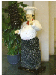
Some of the saints from All Saints' at the CTiR Lunch