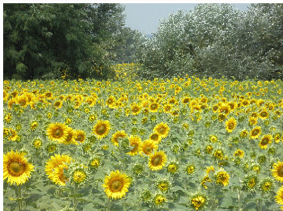
Sun blest sunflowers near Paliano

LAMMASTIDE: 1st August was traditionally celebrated across the UK as Lammas , one of the four Celtic Cross festivals, linked to the old farming calendar. Lammas takes its name from hlafmaesse , the Old English for loaf mass, the time when the cereal crops were harvested. There are direct links to other cultures, such as Ceres, Roman goddess of agriculture.